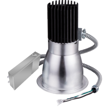
CRLX6-50-80W-MP Complete Unit